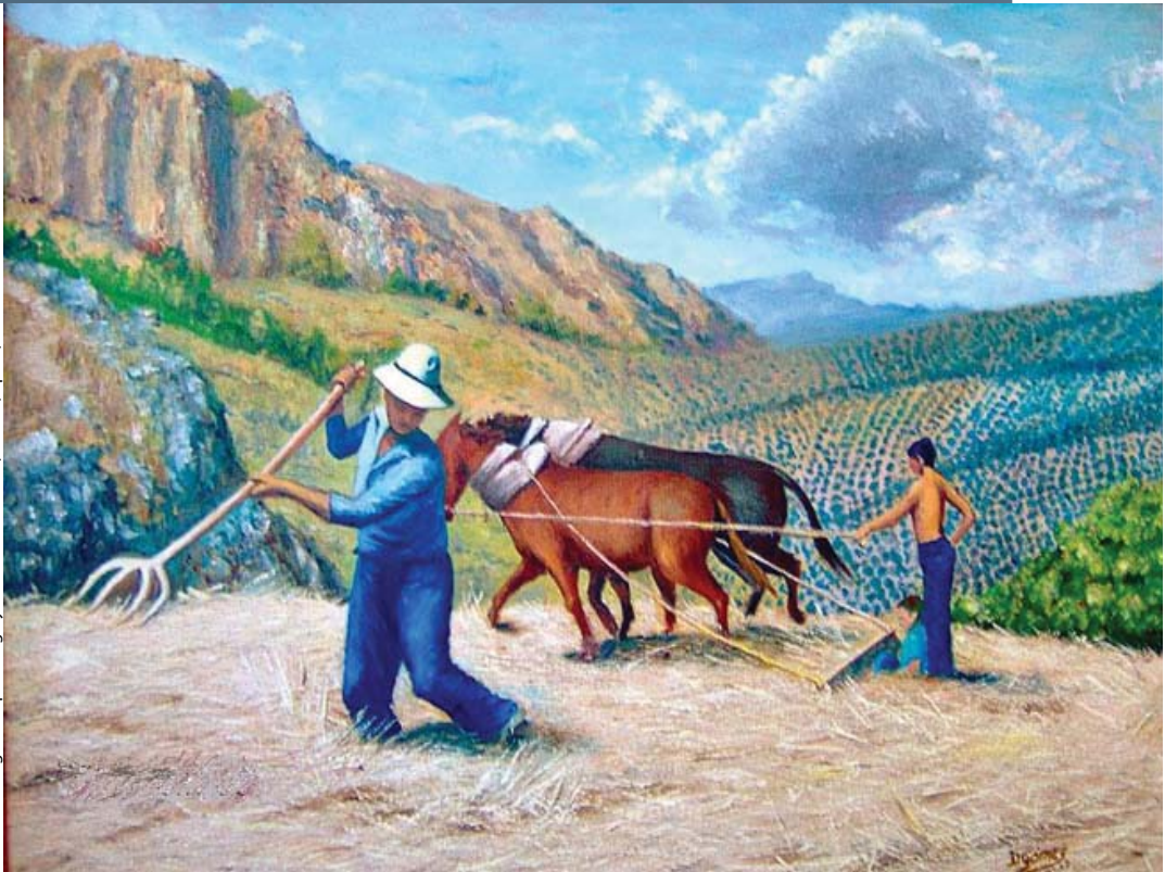
"The threshing floor" painting by Demetrio Gomez (Madrid, Spain)