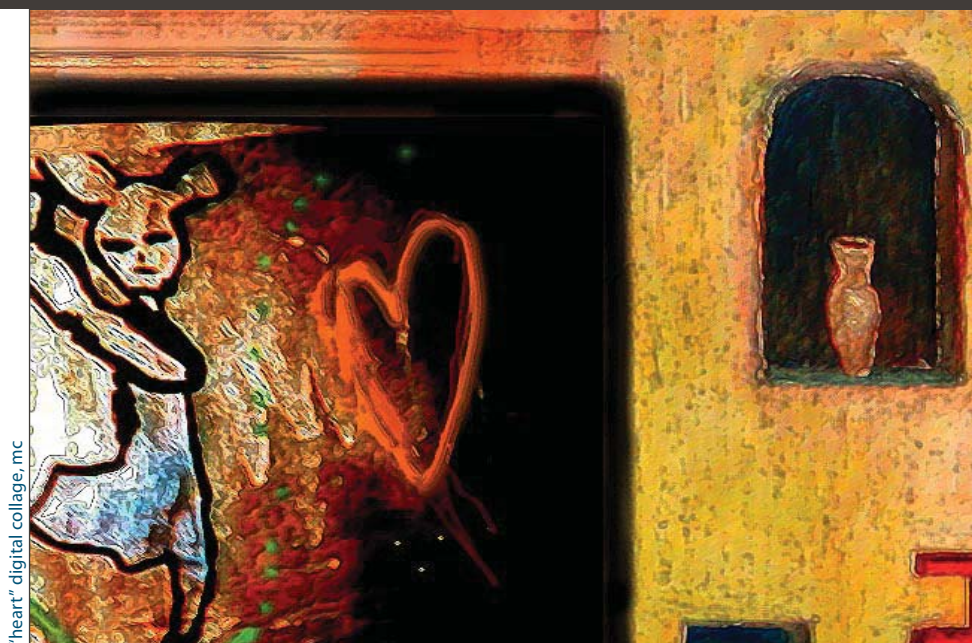
"heart" digital collage.mc