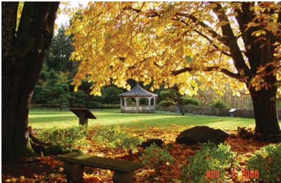
View from the Dumas Bay Centre

Theme: “The Magnificent Synergy of Seven” Hosted by Washington State Urantia Association At the Dumas Bay Retreat Centre