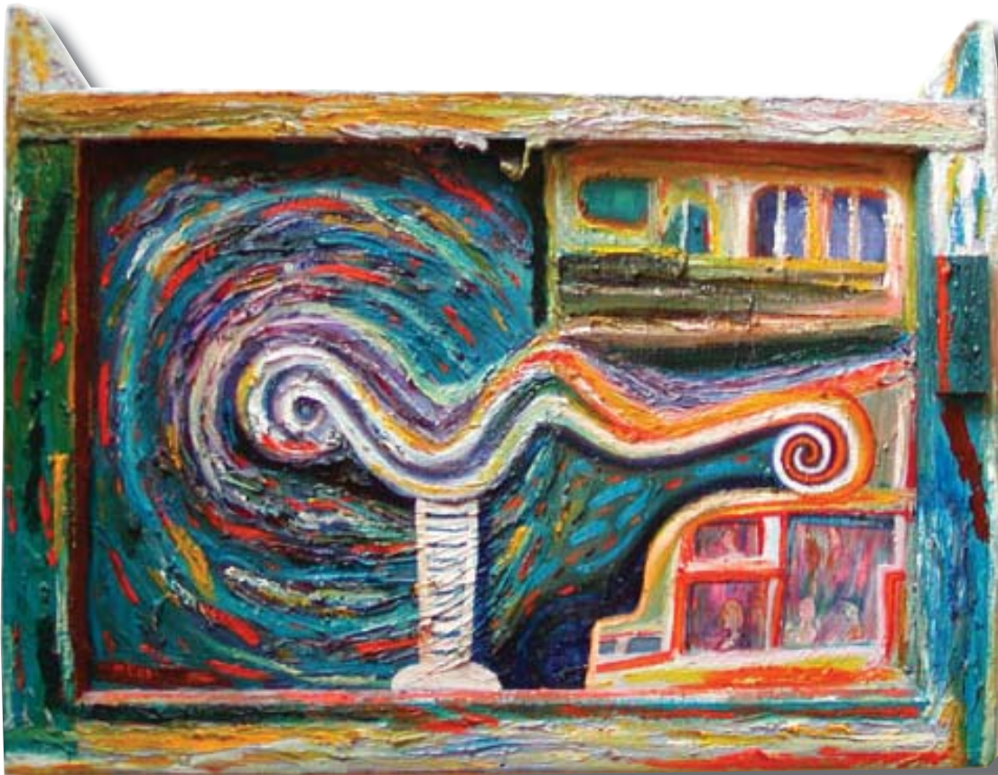
"Passengers" oil on window, painting by M. Caoile