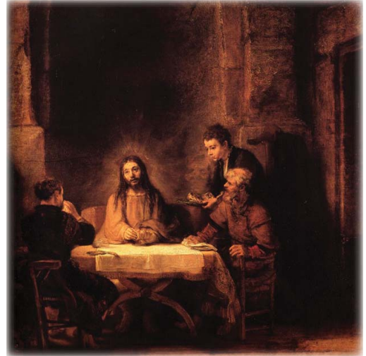
"Supper at Emmaus" Rembrandt van Rijn, 1629

We live our lives upon this world And try to learn right from wrong. The Spirit of Truth Is our conscience.