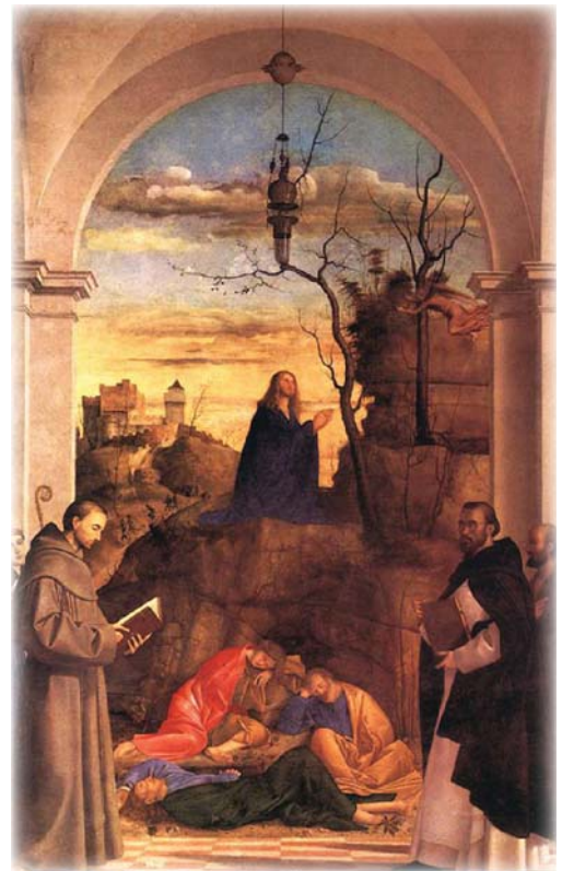
"Christ Praying in the Garden" Marco Basaiti, oil on panel, 1516

We take flight...To God belongs all glory