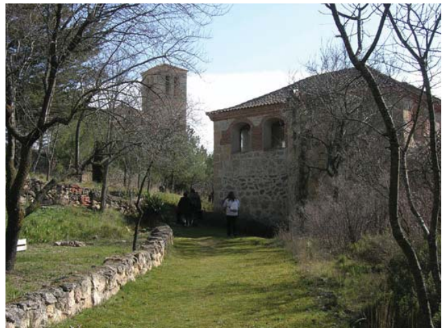
Monastery of San Juan de la Cruz in Segovia near Madrid