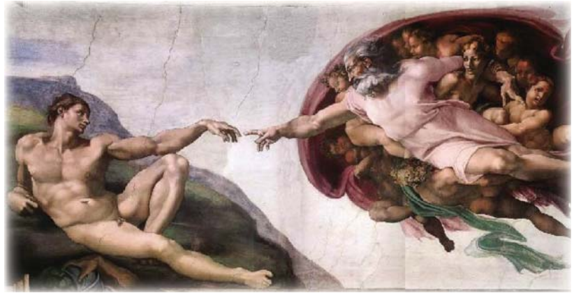
"Creation of Adam" Fresco by Michelangelo Buonarroti, 1510