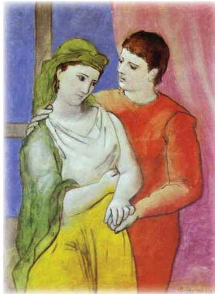
"The Lovers" Pablo Picasso, 1923

The Father's love follows us now and throughout the endless circle of the eternal ages. As you ponder the loving nature of God, there is only one reasonable and natural personality reaction thereto: You will increasingly love your Maker; you will yield to God an affection analogous to that given by a child to an earthly parent; for, as a father, a real father, a true father, loves his children, so the Universal Father loves and forever seeks the welfare of his created sons and daughters. [40:1]