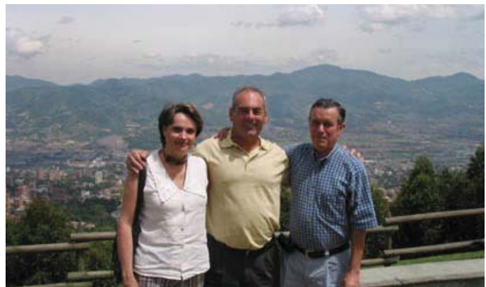
Friends in Medellín

augments all beauty and exalts all kindness. Through wise symbols, man is able to live and augment his capacity for the appreciation of his friends. This power and possibility of mutual stimulus of imagination is one of the supreme glories of human friendship. There exists a great innate spiritual power in the conscience of being consecrated full hearted to a common cause, of being mutually loyal to a cosmic Deity. □