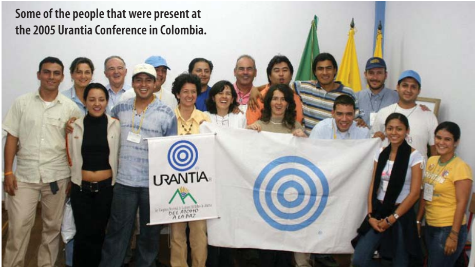
Some of the people that were present at the 2005 Urantia Conference in Colombia.