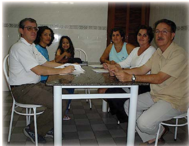
Jundiaí study group