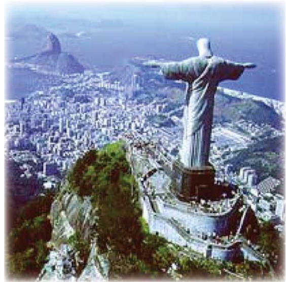
Statue of Christ over Rio de Janeiro

The amazing Spanish author, J.J. Benitez, has much to do with the existing situation. His fiction novels are all translated and sold in Portuguese. He has revealed to his large readership that the source of many of his stories is from "The Fundación Urantia." The Spanish-speaking source seekers had El Libro de Urantia available and waiting for them... note the Foundation's records of how the Spanish edition had recently been outselling the English one. What Brazil, Portugal, and her handful of colonies