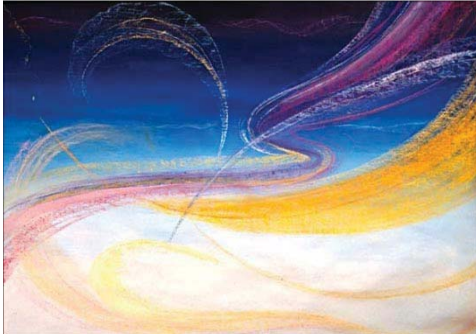
“Recent № 19” © Carol Cannon