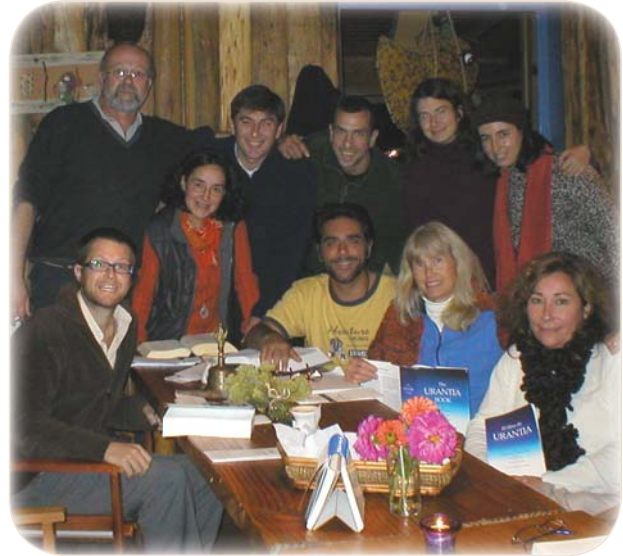
Puerto Varas study group, April 2005

This is a huge, beautiful old train station which has been converted to an exposition hall. I stayed with the cousin of a Chilean friend of mine who I was also able to