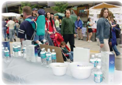
Street fair at the U District

Some people would ask questions but because we were so busy selling water we really could not strive after them, we could only answer their questions quickly. Many times I told them a page and paragraph that might answer their questions, which immediately would plant their nose between the pages. One young fellow stopped by with his girlfriend and as he excitedly turned the pages, looked over at his girlfriend and said, “Do you see what this is, this is incredible, I’ve got to have this book.” A young woman stopped and said, “I have this book, my father’s really into it, I guess I should try again to read it.” At one point three young men flanked the front of our booth with the demeanor of skepticism, and asked a question, “What is this?” So I told them to open to the first page of the Forward and read the first paragraph and the last paragraph and if that did not grab them, there was nothing more that I can say that would. So they stood