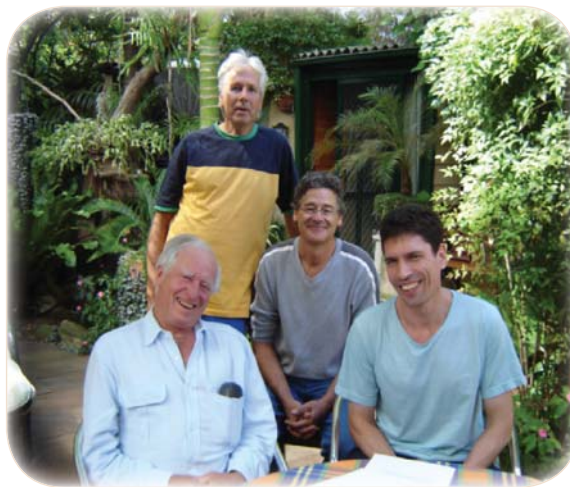
A small Aussie team B

3) The “Reward of Faith” stream – touching the source. This stream will explore ways of finding the values and meanings to launch ourselves all the way to the Father. It will focus on the individual dealing with the fact of isolation and how to grow as a team player. It will discover