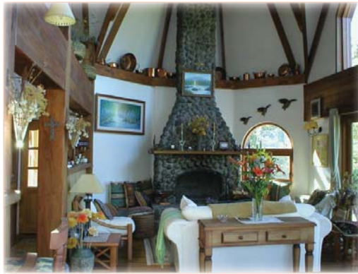
Fireplace study group setting