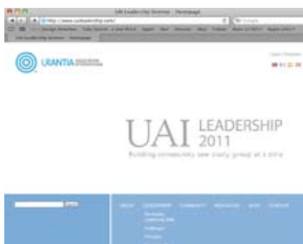
Leadership website homepage

For more information please go to www.uaileadership.com or email us at uaileadership@gmail.com □