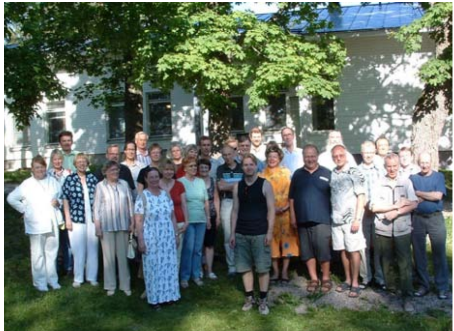
Finland Urantia Association picnic 2009