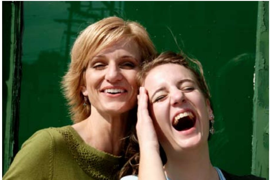
Mother and daughter, share a light moment.

I feel like we cannot — should not — go past any minute or insignificant thing — as tiresome as this might be. It's like when work-