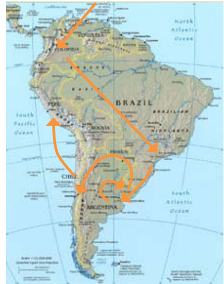
South American trip — 6 countries visited

moved by their savoir-faire with their children that tears occasionally wet me with the love vowed to them.