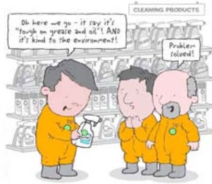
Best Available Technology ?

We need a system, which utilizes the natural human passion to reap benefits from hard, honest work, but shares excessive profits among the whole of society which provides all the facilities to us. Automobiles do not stay