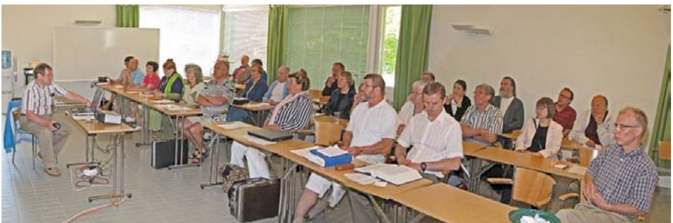
Class room session during the Summer Conference 2008