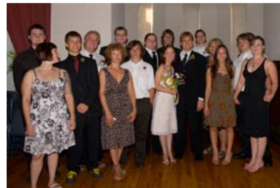
Friends gather to celebrate with the happy couple