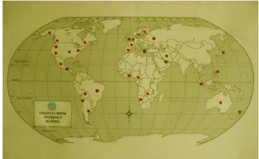
The global classroom – location of our students