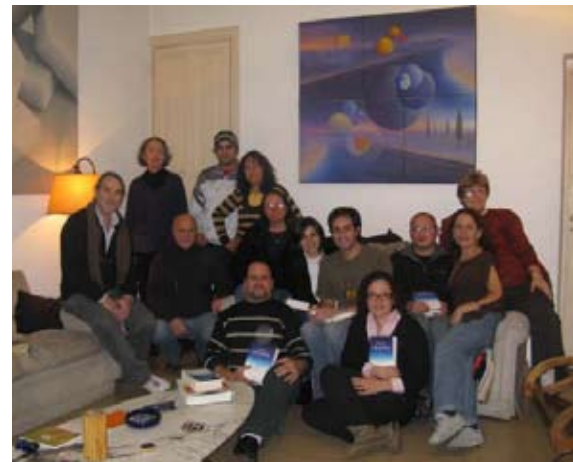
The Buenos Aires Study Group – Argentina

This is such an amazing paper. It is one of the most fundamental (new) truths of the fifth