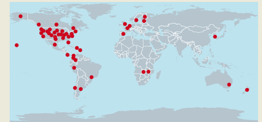
Location of UAI Associations – 2009

of the national and international levels of the organization. A person may become a Member-At-Large if no local or national association exists in their area. UAI is a “grass roots” organization. The RC, the ISB, and the national associations of UAI provide support and guidance to the local associations whose members accomplish the real work of UAI. UAI currently has 10 National Associations and 44 Local Associations with members and friends located in 56 countries around the world.