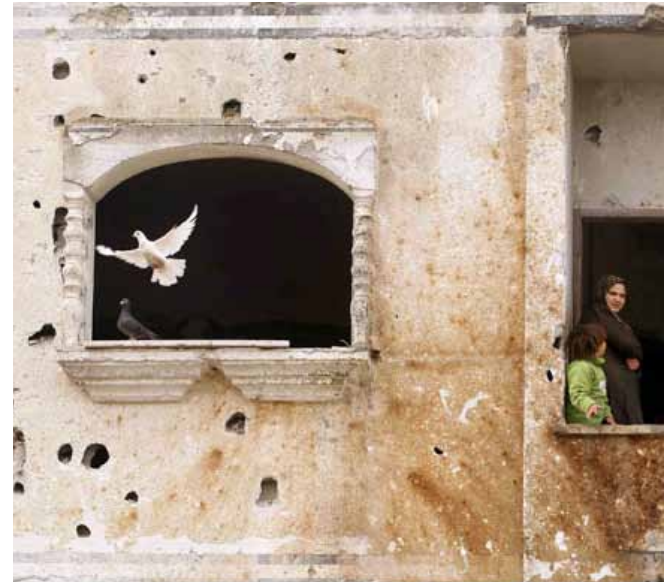
Bird flies free while householders struggle on

All mortal creatures living within the present sphere of the Supreme share his partial completeness, and this can only be completed by obeying the Father's eternal command to be perfect even as he is perfect.