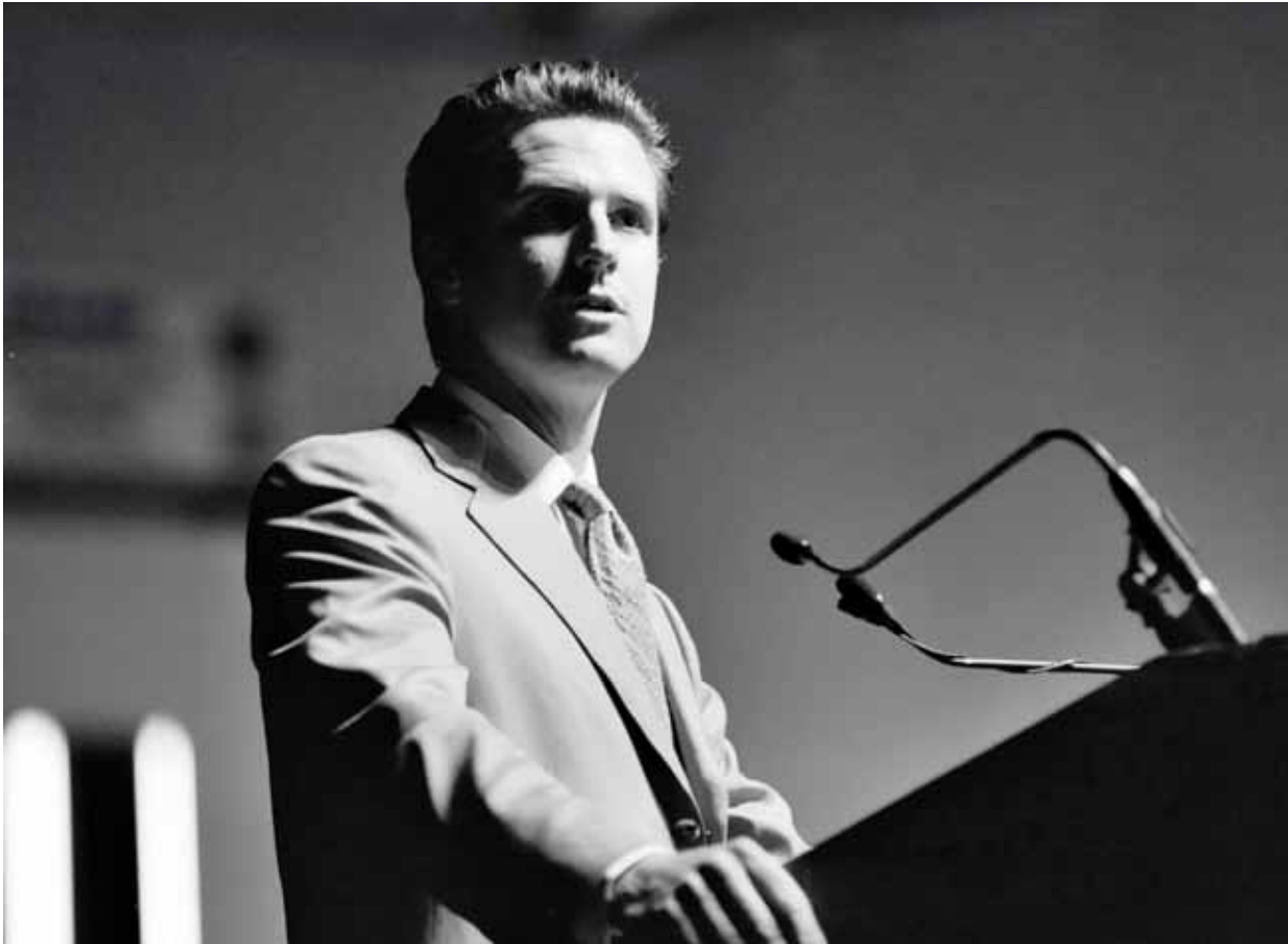
Getting the message across photo

The Adjusters are loving leaders, your safe and sure guides through the dark and uncertain mazes of your short earthly career; they are the patient teachers who so constantly urge their subjects forward in the paths of progressive perfection. [Paper 110:1, page 1203:4]