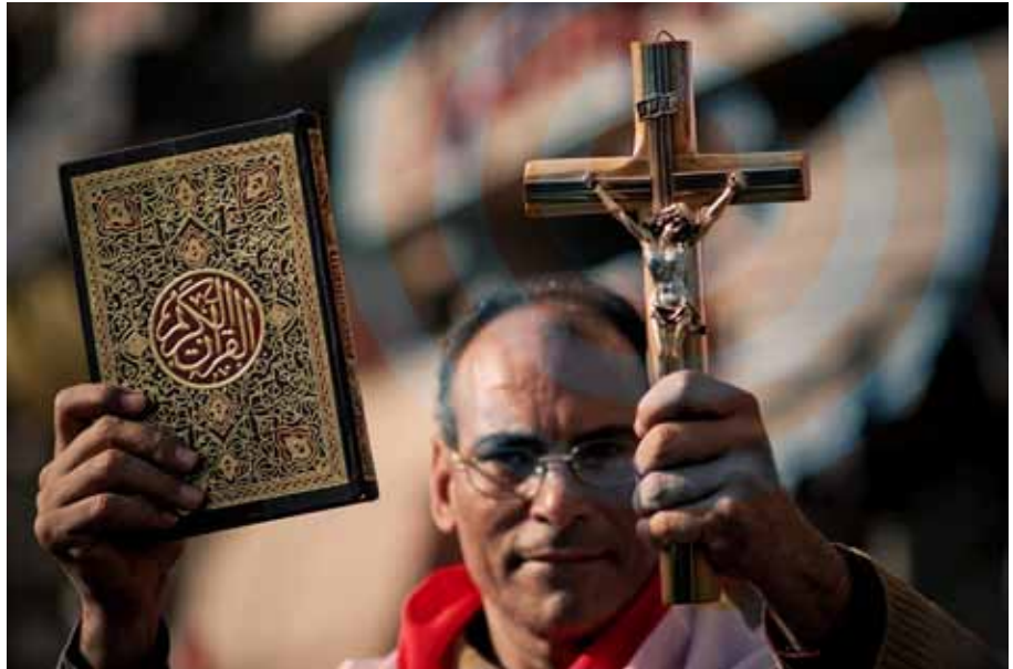
Symbols of faith to one Father of all creation

T HE ISSUE OF ISLAM AND THE TEACHINGS in The Urantia Book seem to be a recurrent subject matter for many readers. During the last [UAI] symposium in Chicago, I was asked the same question about my views of Islam several times. To understand this issue, in my humble opinion, it is best that one have direct experience first and then focus on the teachings, suggestions, and conclusions drawn from a careful reading of The Urantia Book . Herein I attempt to combine these approaches.