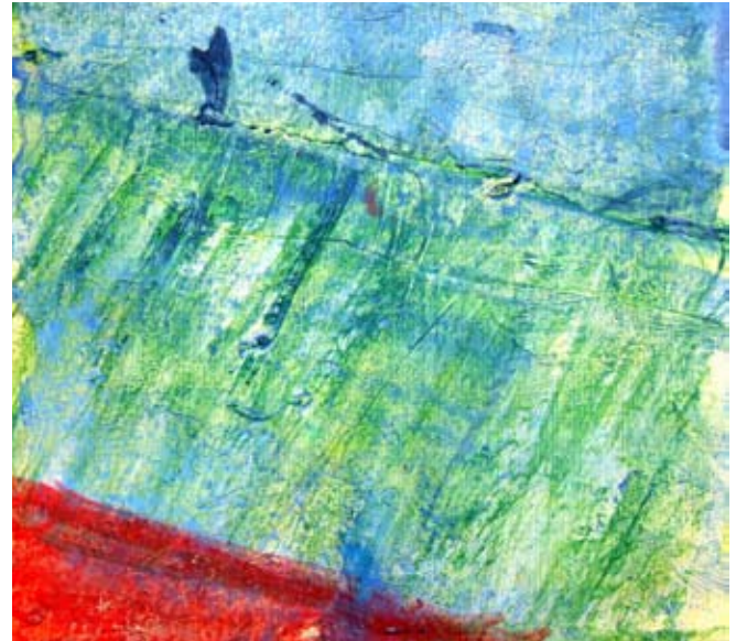
Mindscape acrylic painting

...a part of the control of this universe is mechanistic. And why should God be personally concerned with something which a machine can handle?